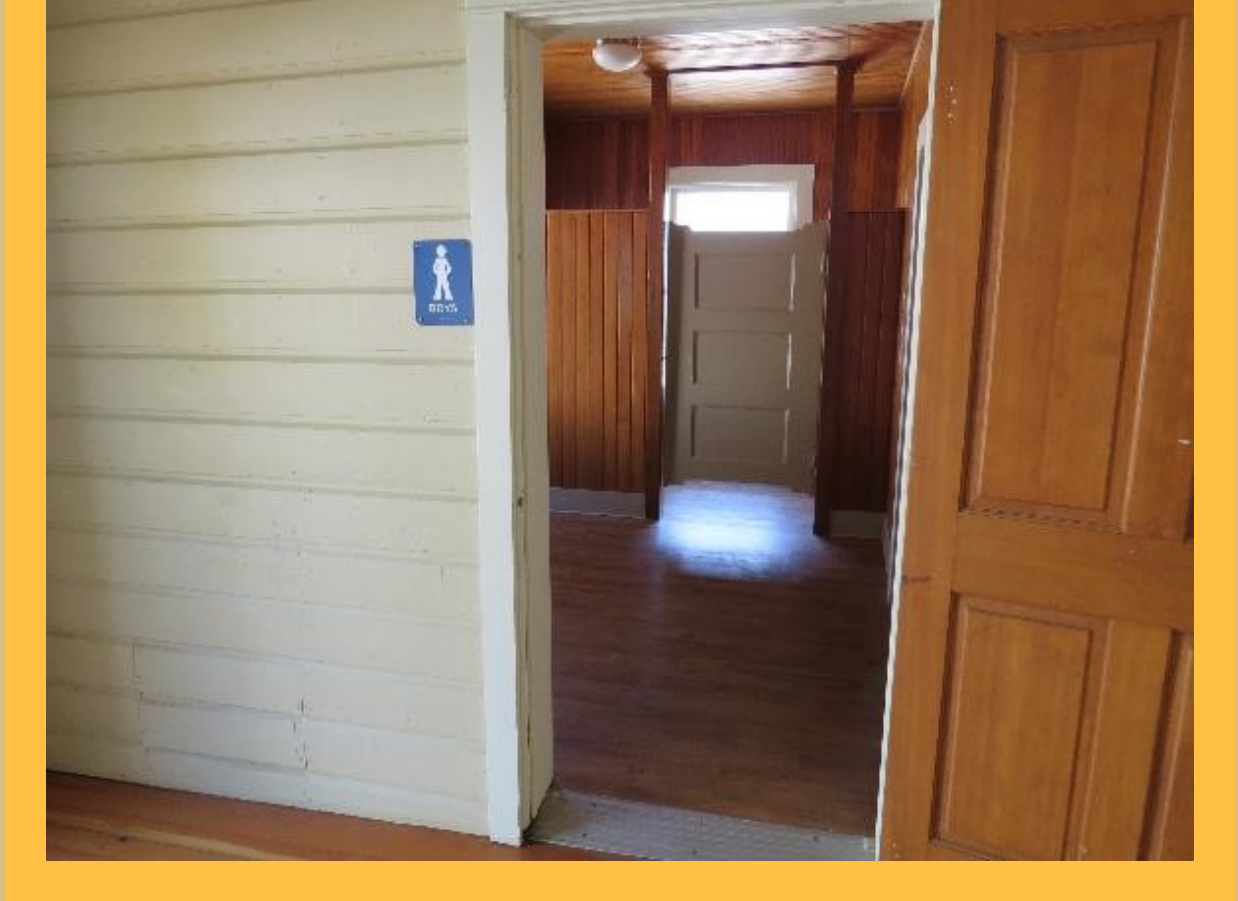
The boys' restroom was the principal's office.