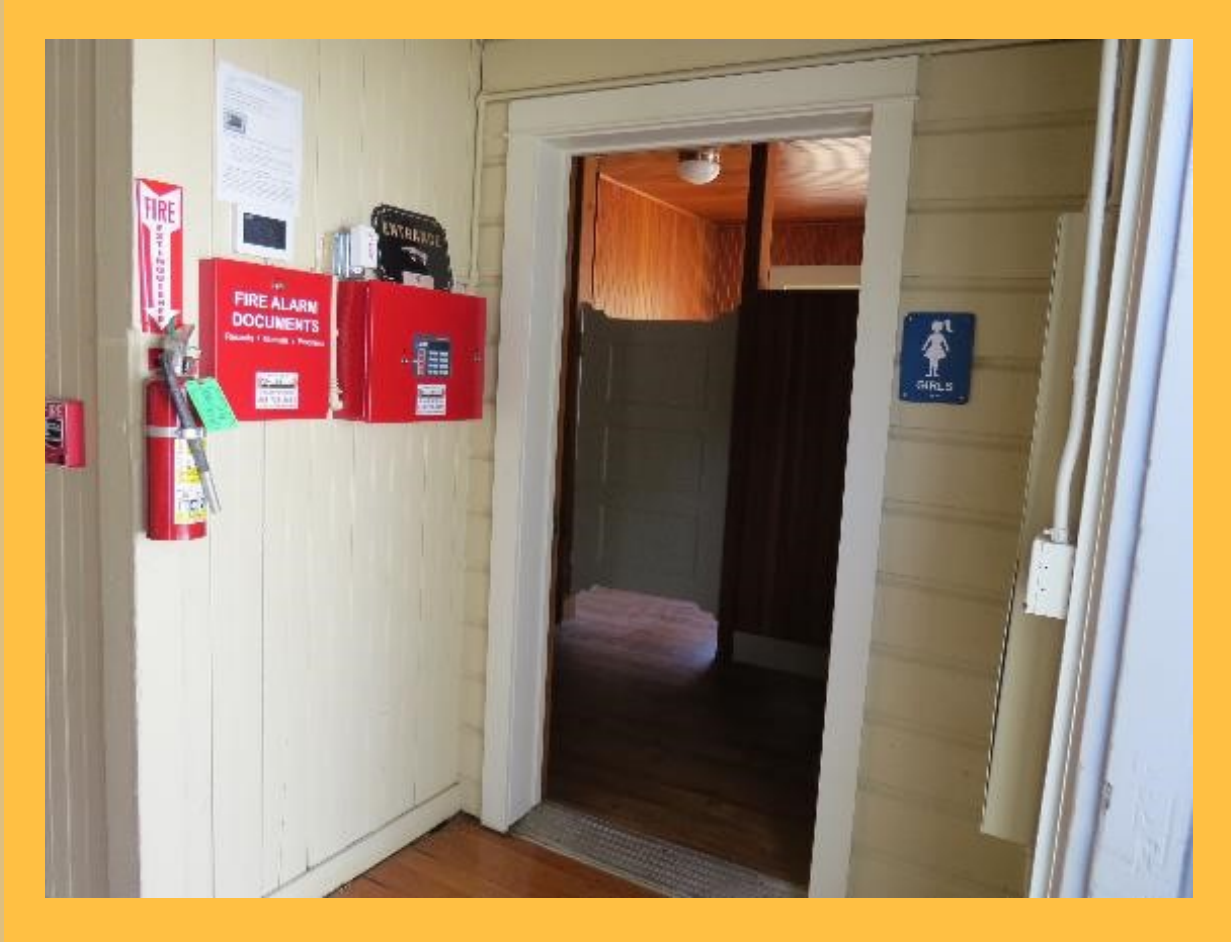
Today's girls' restroom is the former teachers' lounge.

Those two small squares are the original outhouses still in place at the Historic Grammar School. According to some alumni, they were still in use into the 1950's.