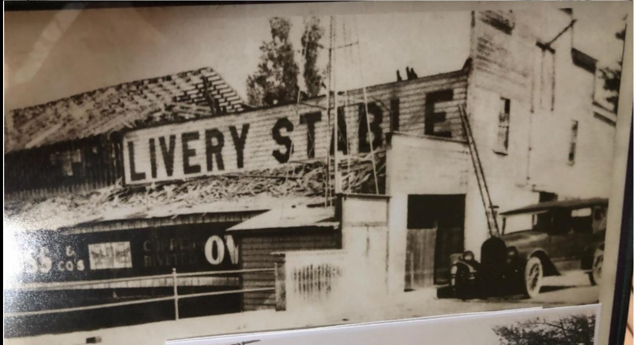
Livery stable photo from April 8, 1928. Taken during destruction.