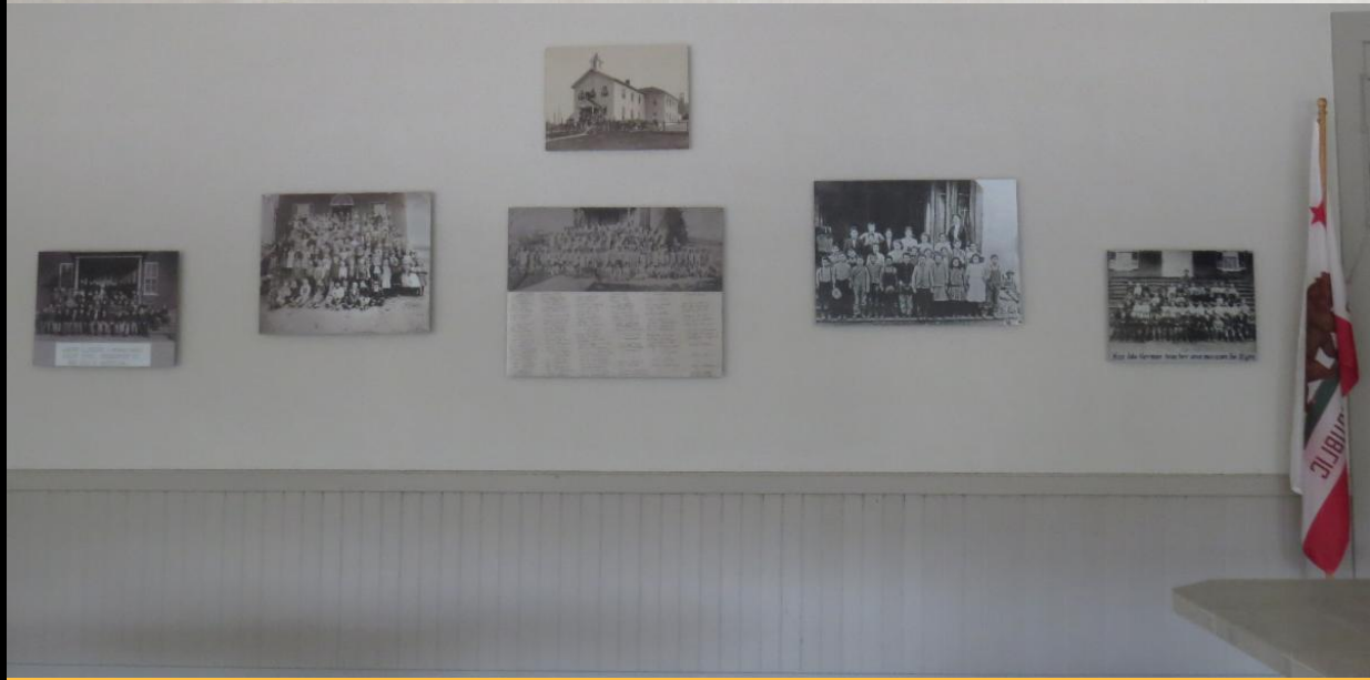
The kitchen area now includes a menu board and additional photos of the school and children dating back to 1871. Photos of different aspects of Sutter Creek's history are displayed in rooms throughout the school.