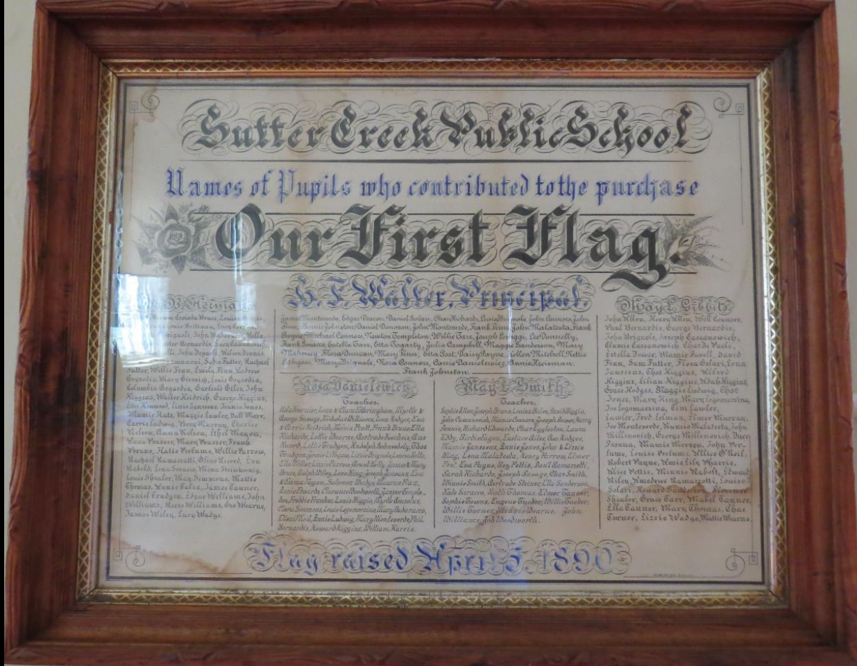
(This framed document is on display in the museum room. )